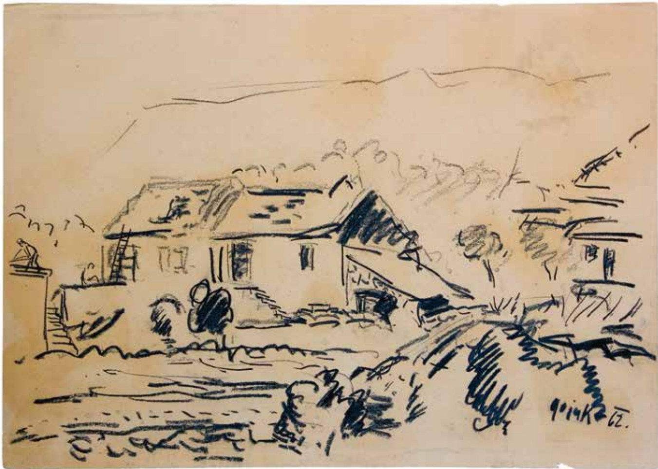
Roofs – repair, 1962 (Cat. No. 1)