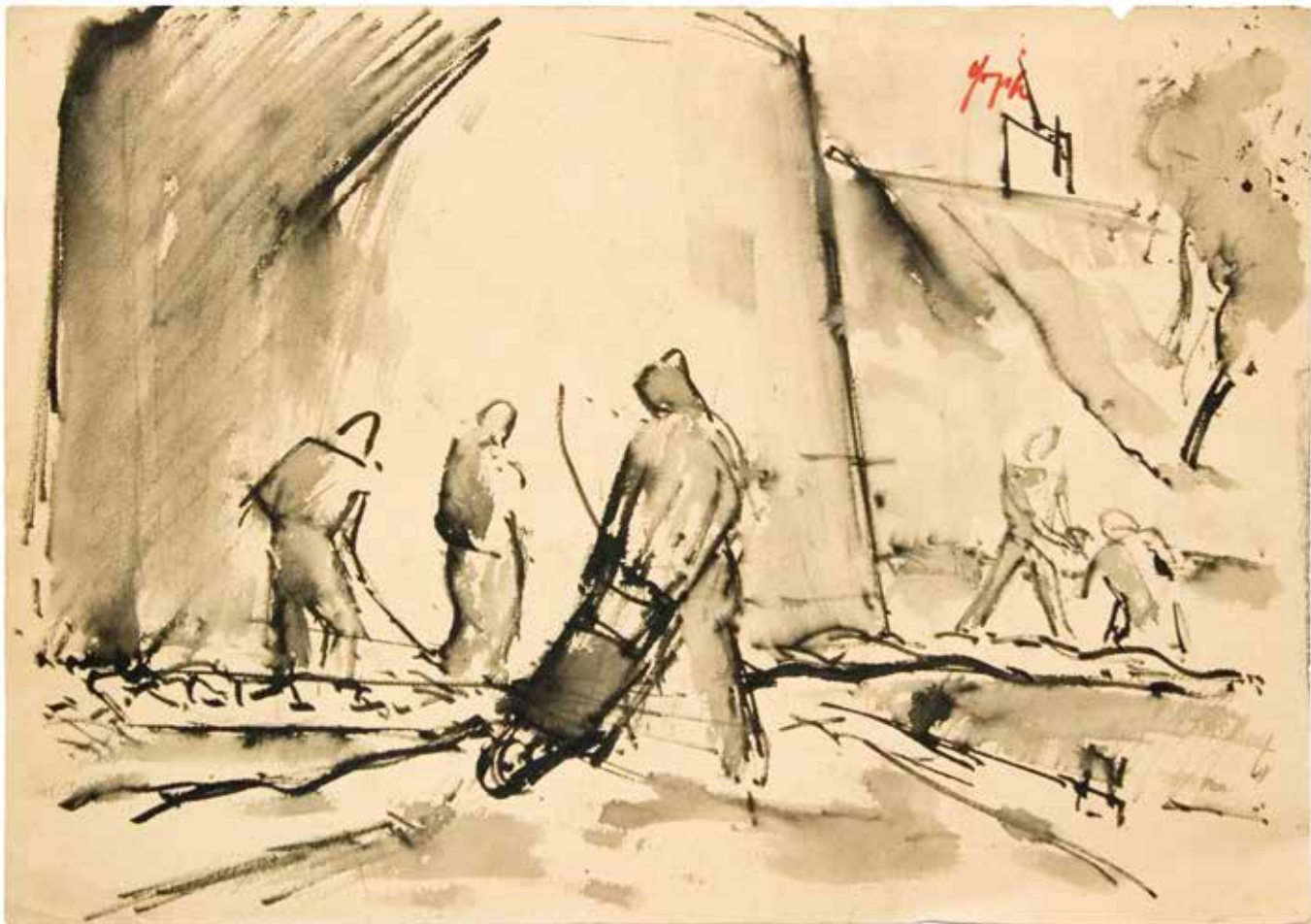
Workers, s.a. (Cat. No. 12)