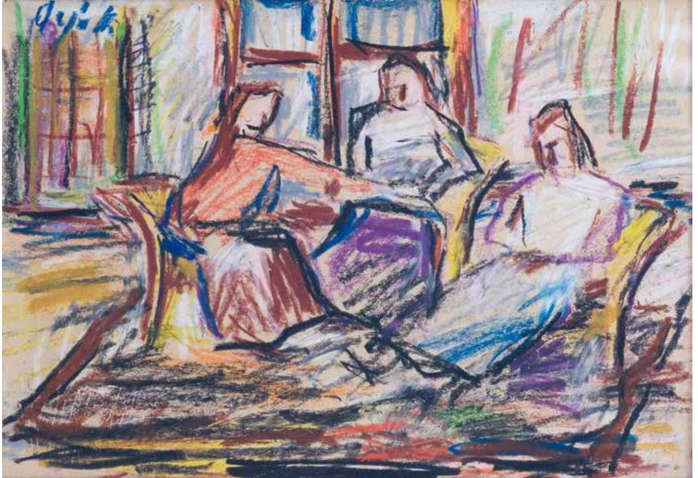
Gossipers, s.a. (Cat. No. 20)