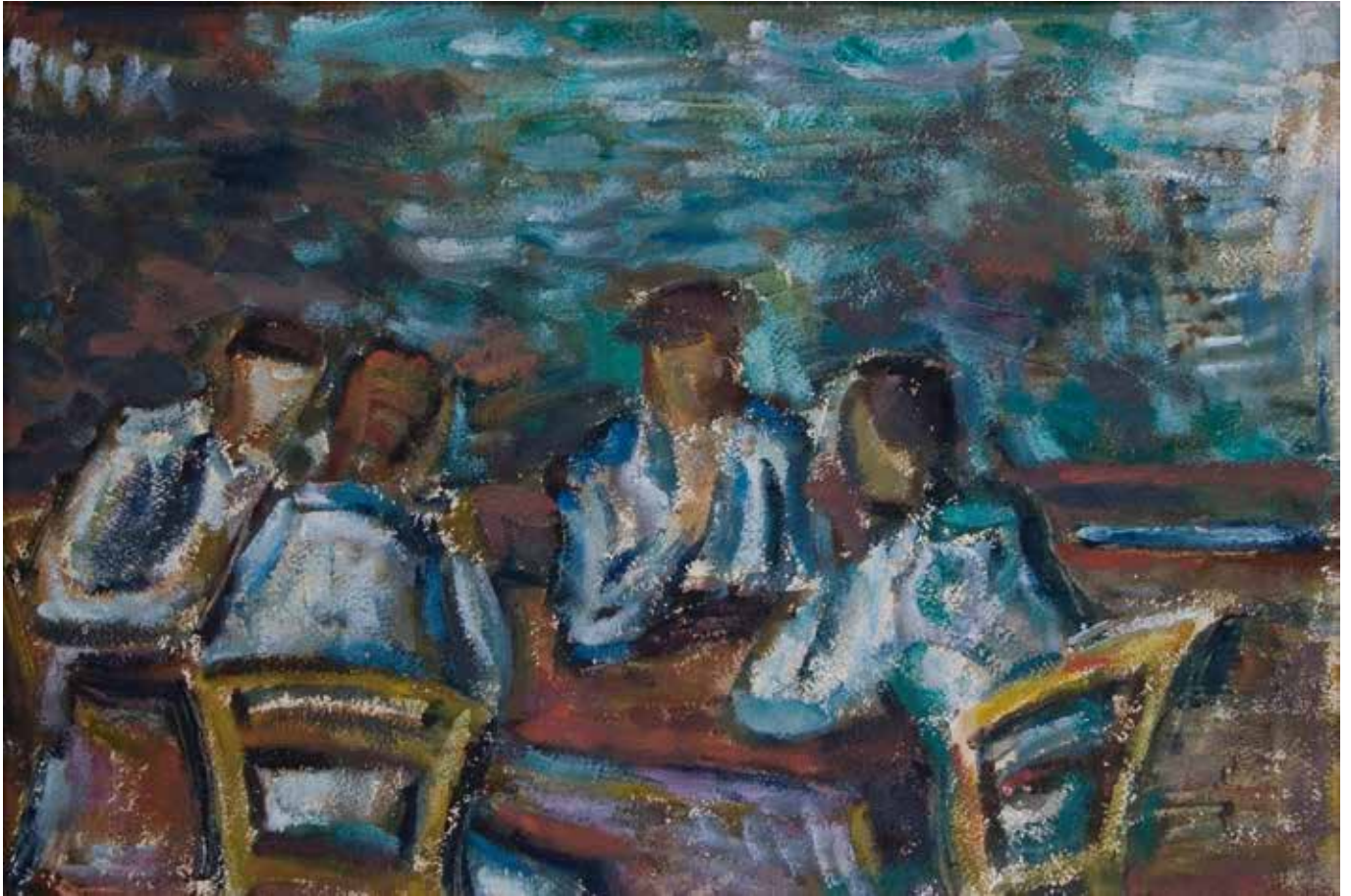
Card players at the table, s.a. (Cat. No. 28)