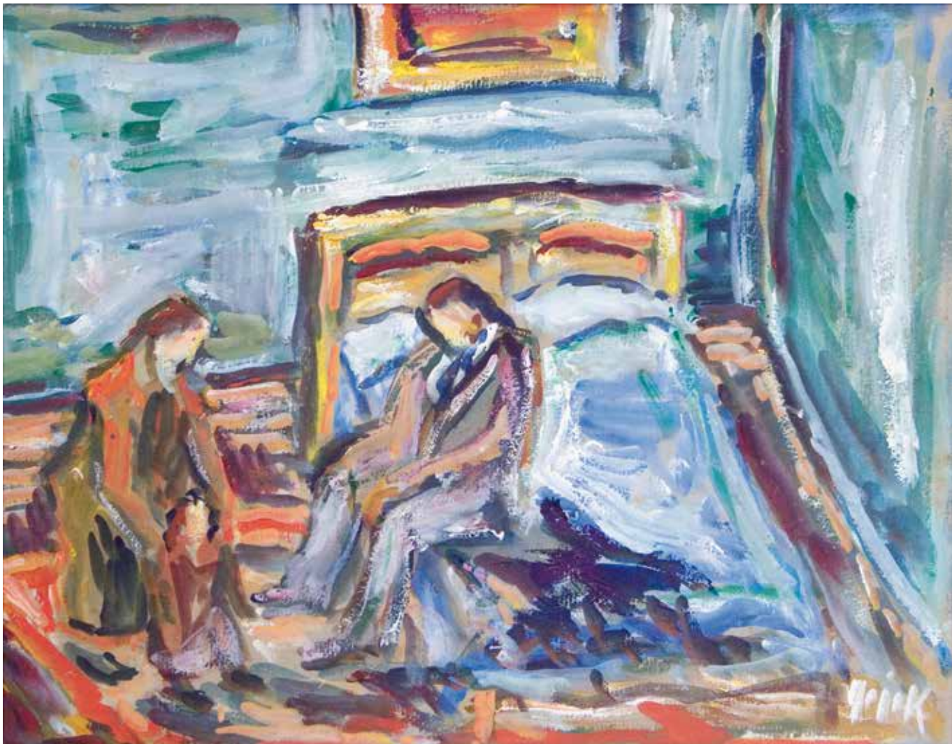
Grandfather, daughter and grandson, 1979 (Cat. No. 29)