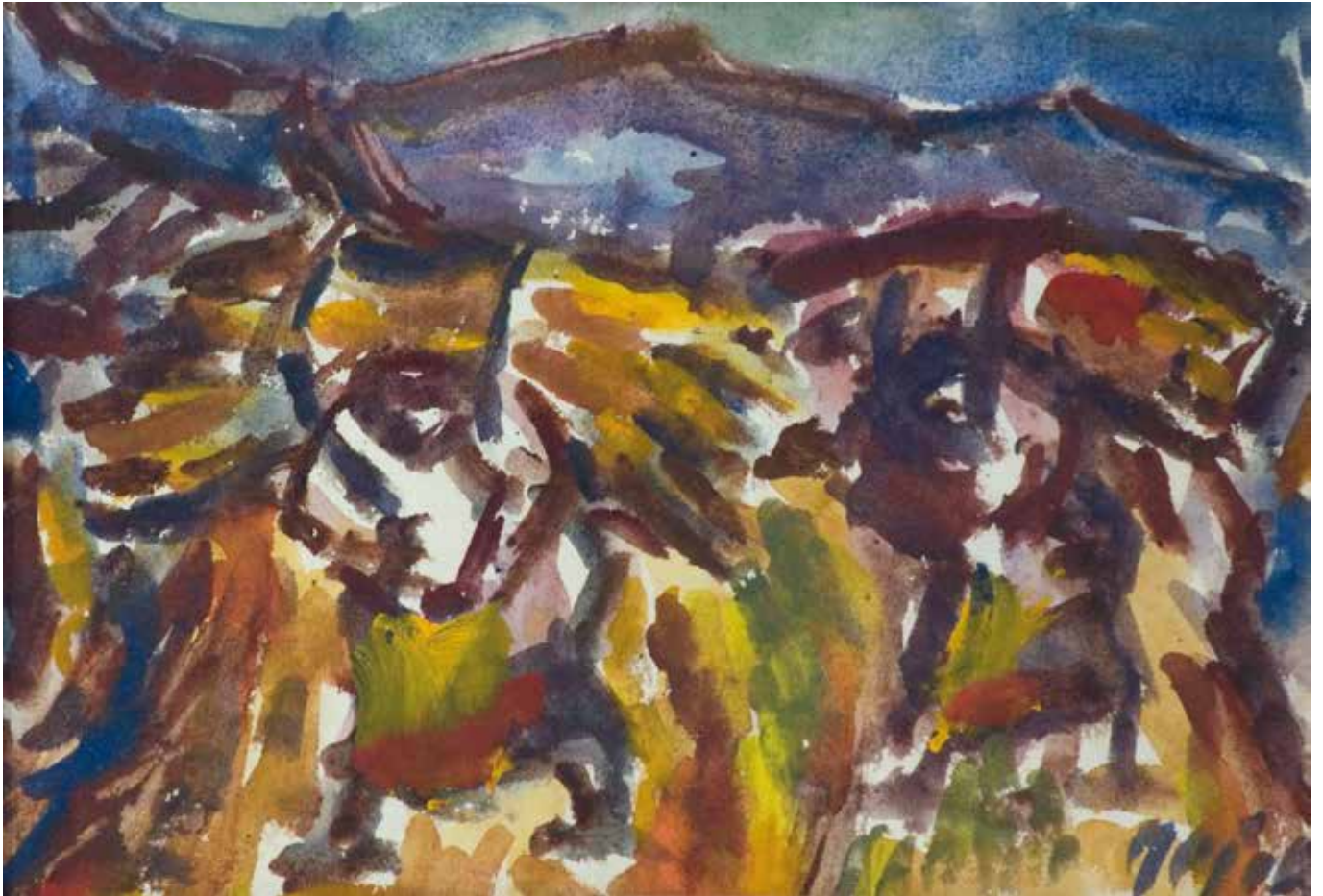
Women with burdens, s.a. (Cat. No. 17)