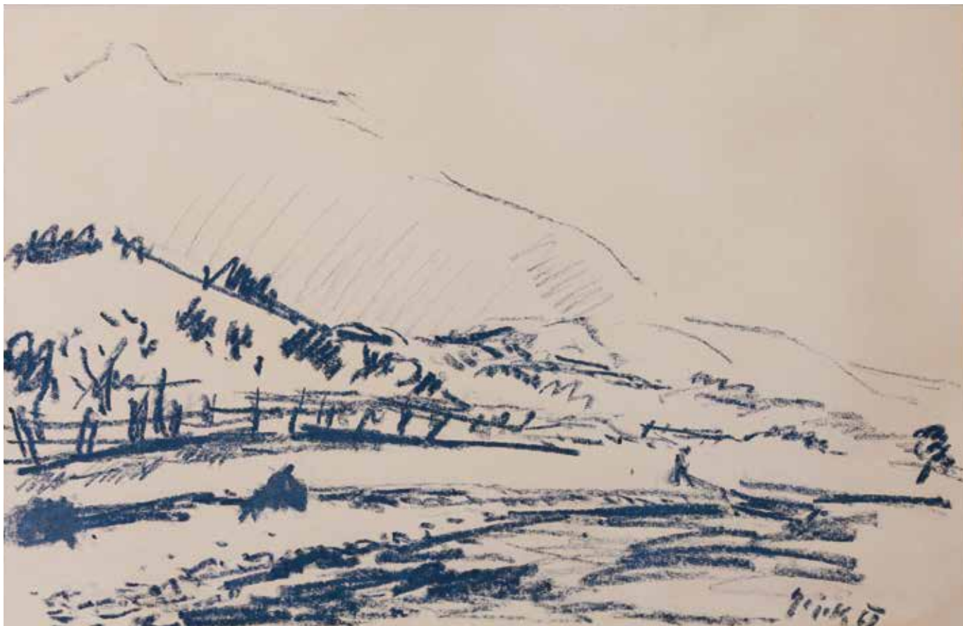
Cvitačka, 1962 (Cat. No. 1.)