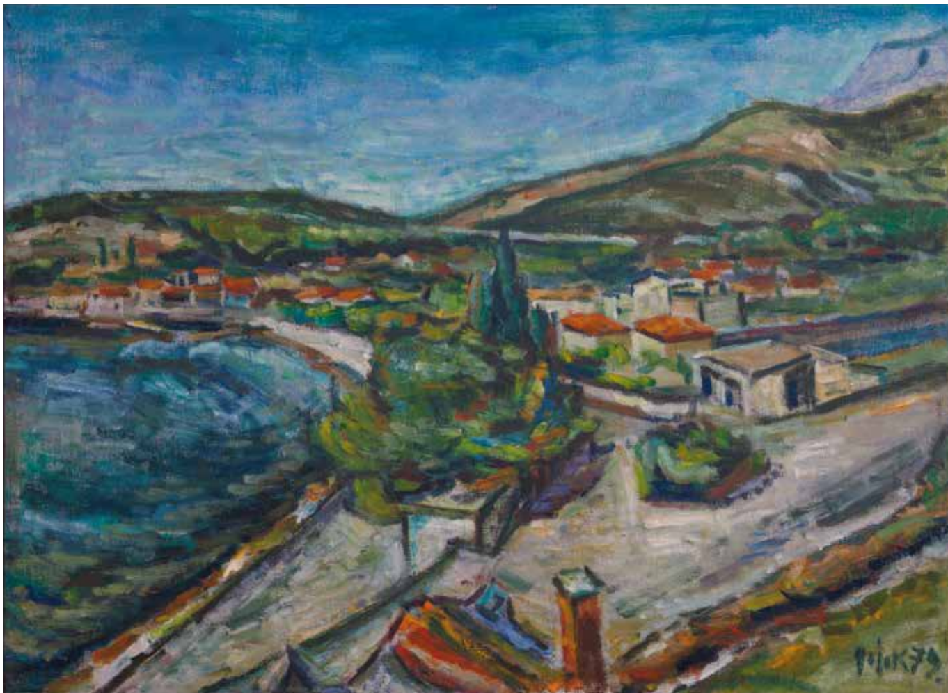
Drvenik - Donja Vala, 1979 (Cat. No. 16.)