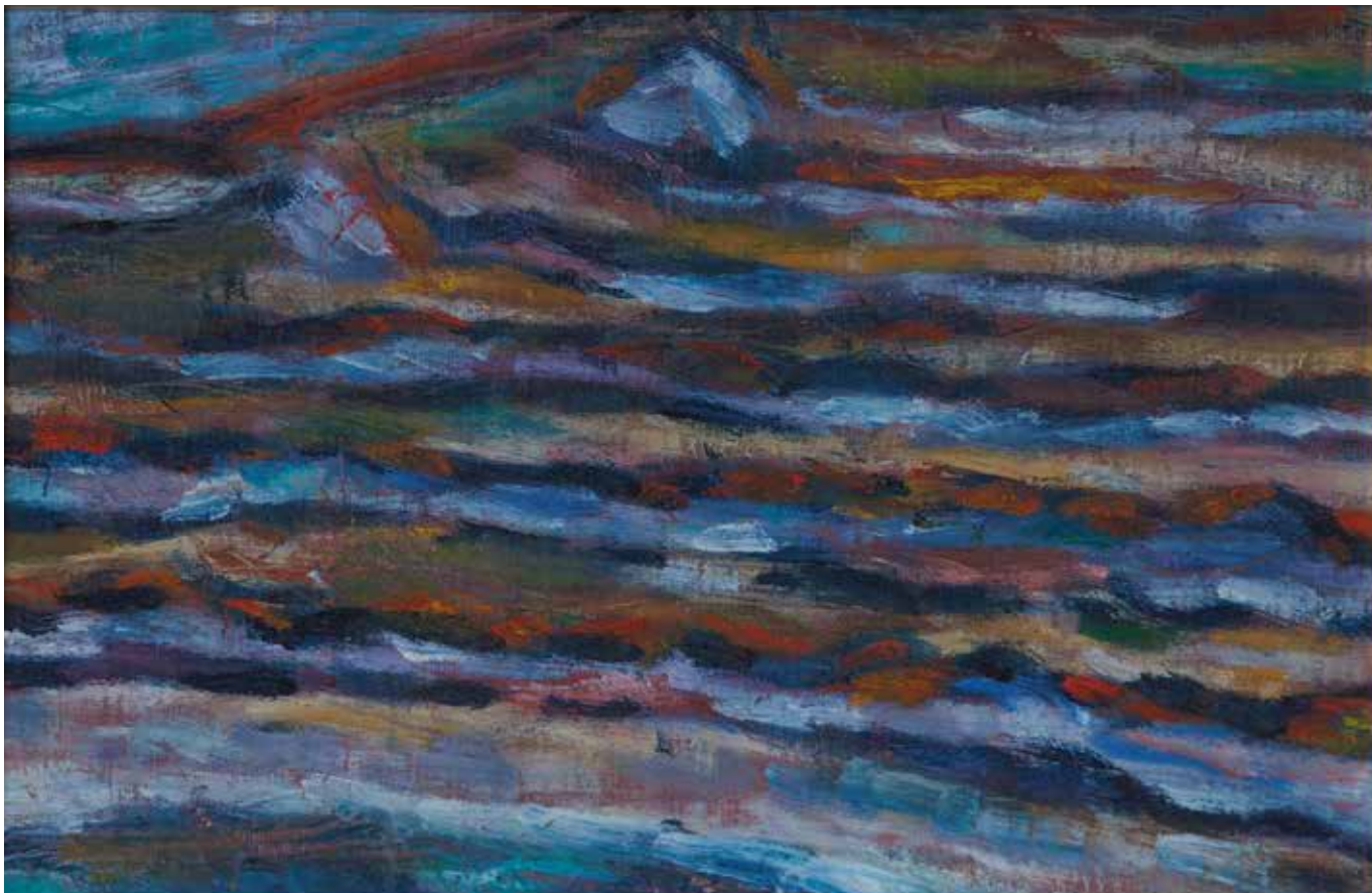
Cvitačka, s.a. (Cat. No. 9.)