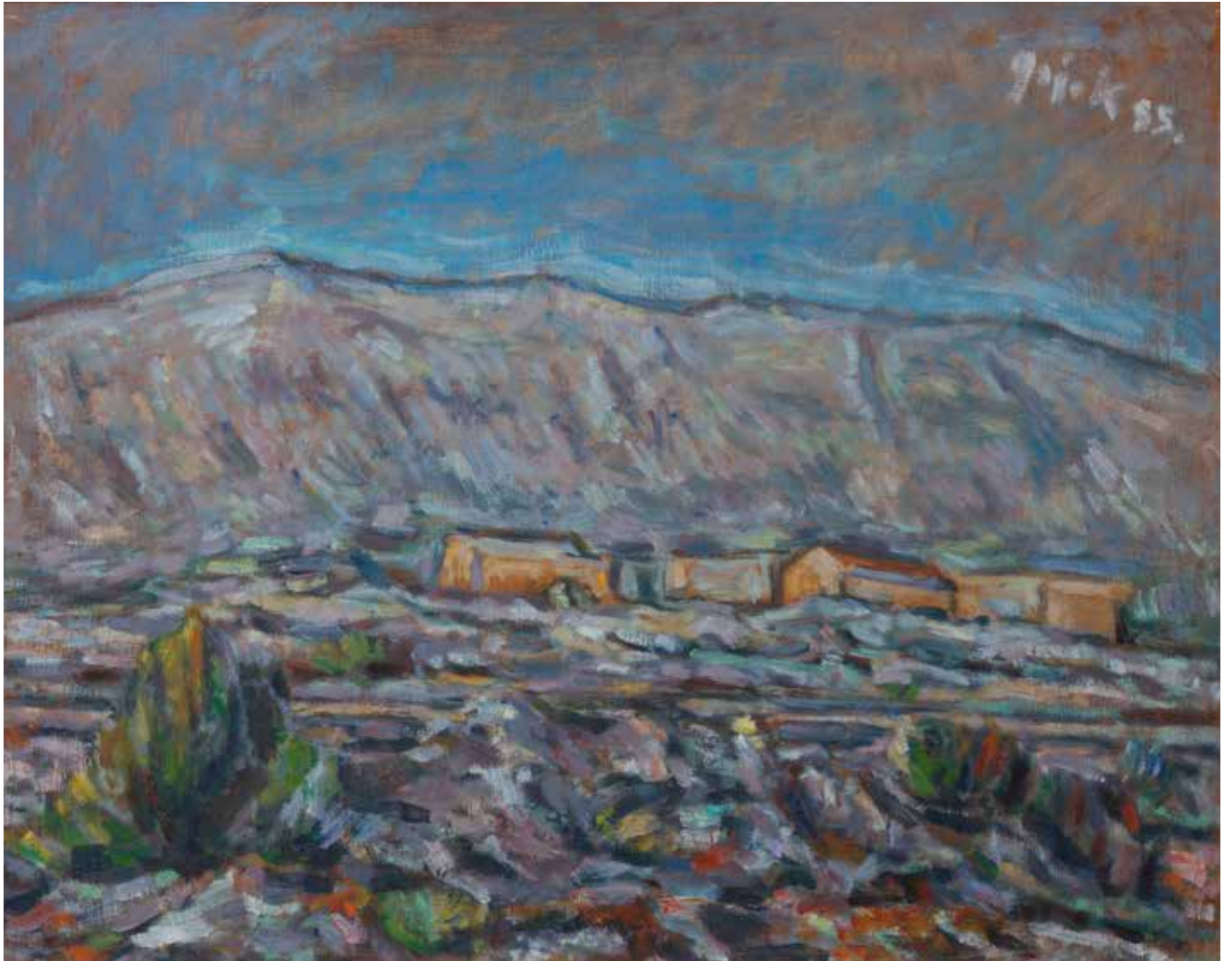
Rocky ground in Zavojane, 1985 (Cat. No. 19.)