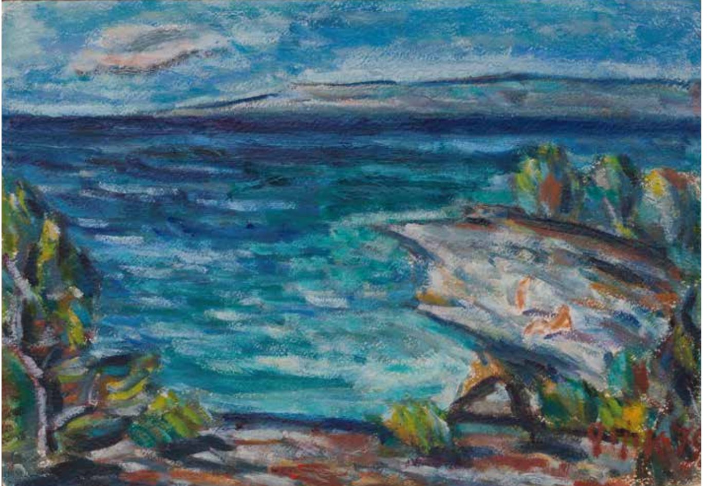
The bora in May, 1979 (Cat. No. 22.)