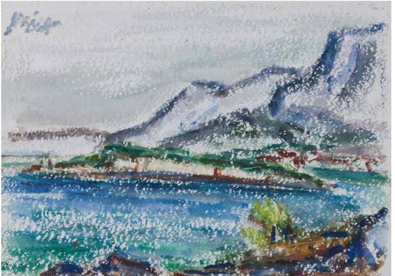
View of St. Peter from Osejava, s.a. (Cat. No. 11.)